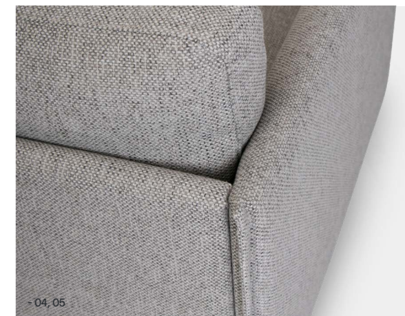
- 04, 05