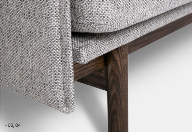
- 02, 04