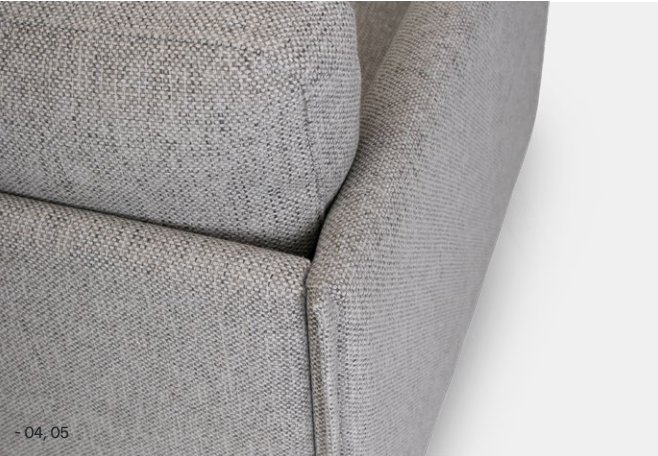
- 04, 05