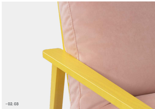
- 02, 03