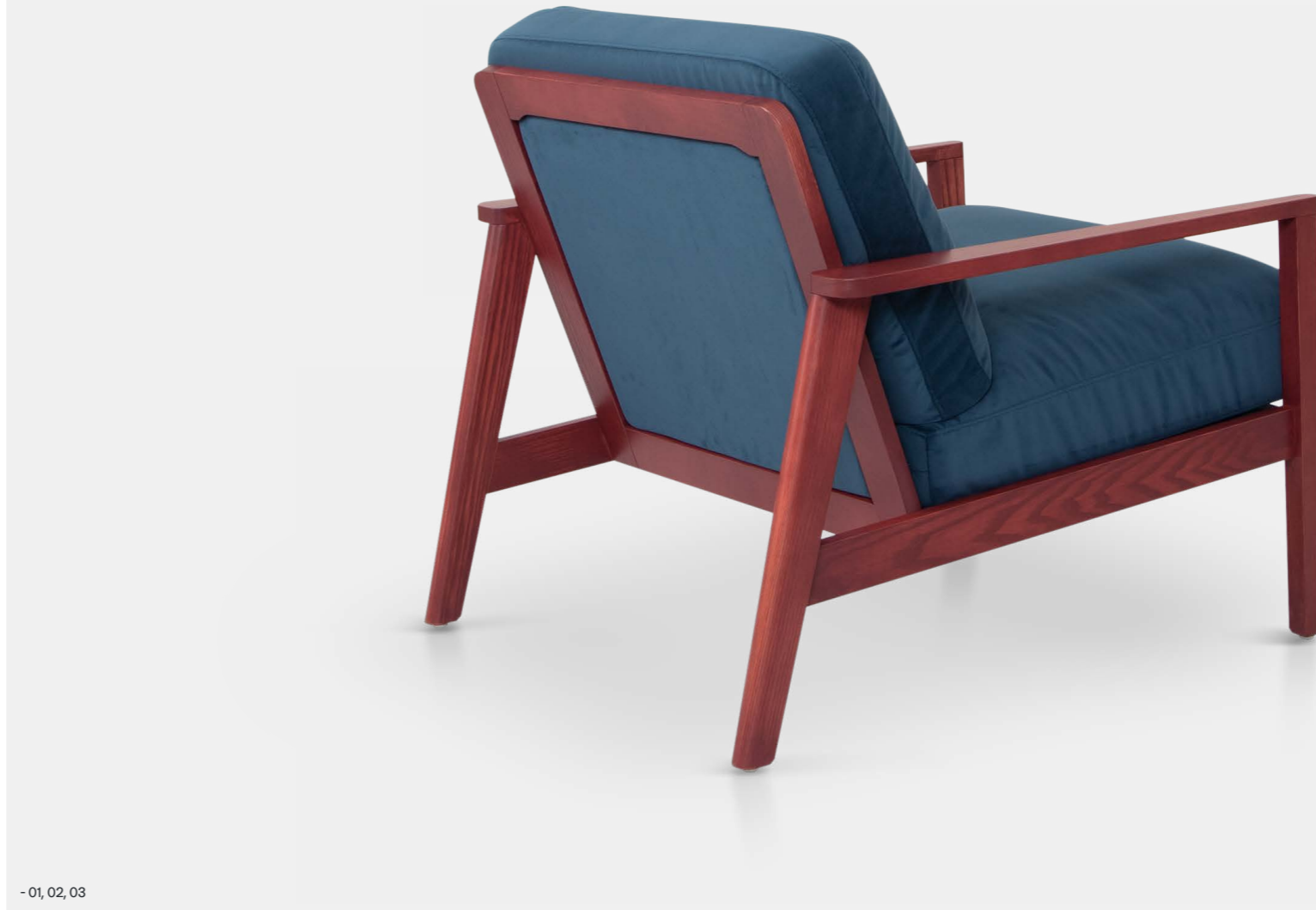
- 01, 02, 03