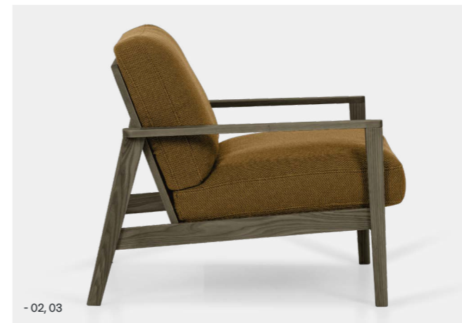
- 02, 03