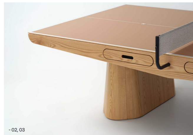
- 02, 03